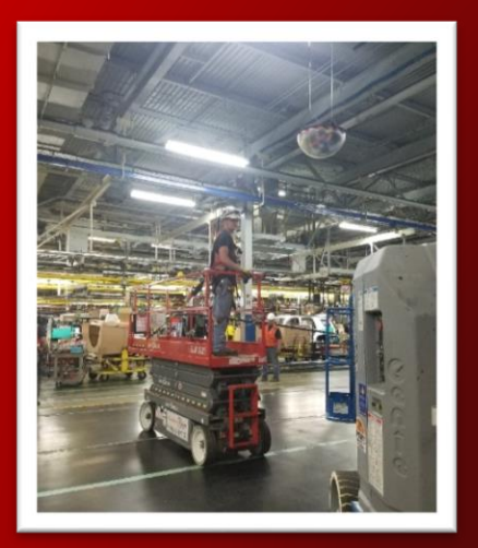
Steven prepping to move pipe